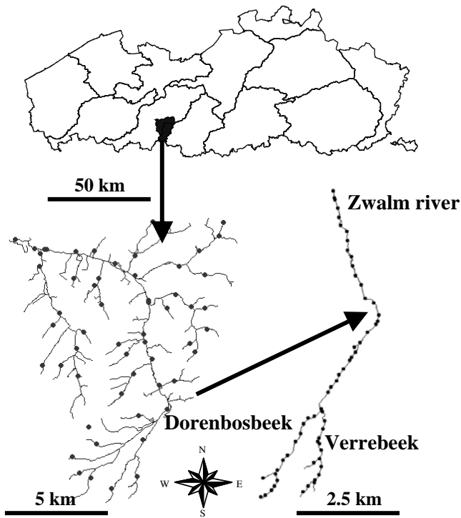
Figure 1. Location of the Zwalm river basin in Flanders, Belgium. Position of the selected sampling sites.

To develop the ANN models, data were used from 60 sampling sites evenly distributed across the Zwalm river basin. Each site was examined on a yearly basis during the period 2000-2003. Each year, monitoring was carried out in summer to minimize seasonal variability. At each site, 26 environmental variables were recorded: temperature ( ^{\circ}\text{C} ), dissolved oxygen ( \text{mg l}^{-1} ), pH, conductivity ( \mu\text{S cm}^{-1} ), suspended solids ( \text{mg l}^{-1} ), nitrate ( \text{mg NO}_3^- \text{l}^{-1} ), phosphate ( \text{mg PO}_4^{3-} \text{l}^{-1} ), ammonium ( \text{mg NH}_4^+ \text{l}^{-1} ), COD ( \text{mg l}^{-1} COD), total phosphorus ( \text{mg P l}^{-1} ) and total nitrogen ( \text{mg N l}^{-1} ), flow velocity ( \text{m s}^{-1} ), water level (cm), width (cm), shade (%), macrophytes (present/absent), the degree of meandering, hollow river banks, deep/shallow variation and artificial embankment structures, the fractions of boulders, pebbles, sand, loam and clay (%) and the distance to mouth (m). Macroinvertebrates were collected by means of a standard handnet (NBN 1984) and by in situ exposure of artificial substrates (De Pauw et al. 1994). The ANN model setup was based on the backpropagation algorithm (Rumelhart et al. 1986) and is described by Dedecker et al. (2004). The ANN models were implemented with the neural network extension of the software package MATLAB 6.1 for MS Windows TM .