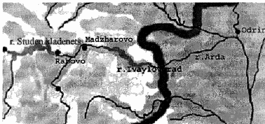
Fig. 1. The district of study

General characterisation of the studied biotopes. Studies have been performed of freshwater ecosystems from the Arda river in the vicinity of the village of Huhla, marked as biotope Huhla (Fig. 1). Biotope Huhla includes a section of the Arda river, starting after the reservoir 'Ivaylovgrad'. It begins with shallow, fast running water and continues with deep pools and slow running water. The bed is entirely gritty and clayey.