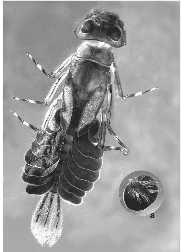
Figure 1. Chiloporter eatoni , dorsal view of nymph and (a) detail of gill, ventral view.

Body dorsoventrally flattened; pigmentation variable and sometimes uneven, most frequently dark brown or reddish brown, occasionally bright yellow. When